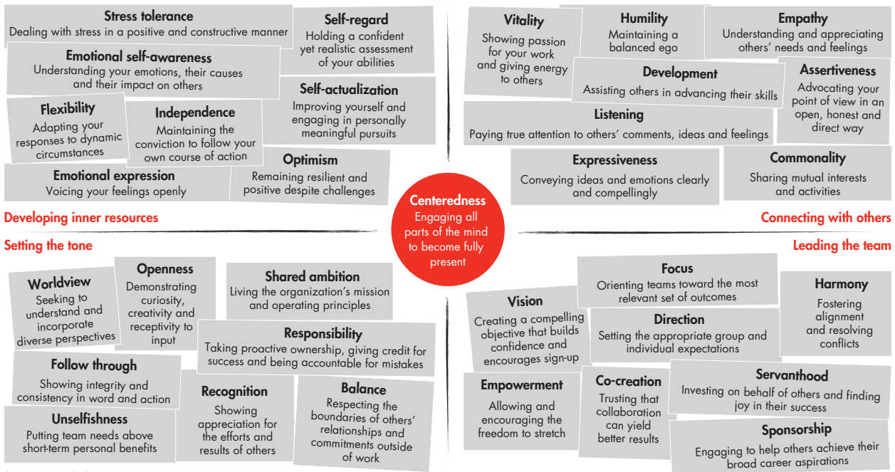
Figure 1: Bain Inspirational Leadership model